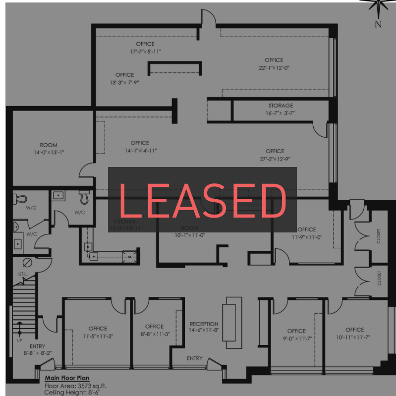
Main Floor Plan Floor Area: 3573 sq.ft. Ceiling Height: 8'-6"

ALL INFORMATION PROVIDED IS THE RESPONSIBILITY OF THE TENANT TO VERIFY IF DEEMED IMPORTANT.